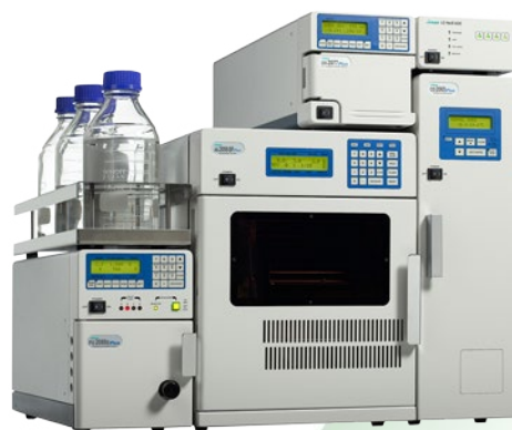
JASCO HPLC System at www.jascoinc.com

Food additive, Sweetener, Saccharin sodium, C18 column, UV detection HPLC